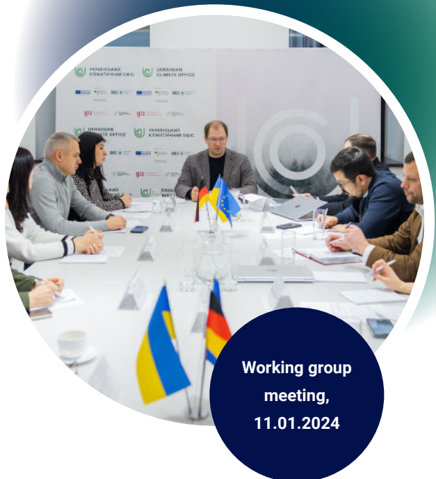
Working group meeting, 11.01.2024

Conducting frequent consultation meetings is crucial and already common practice apart from sectors impacted by martial law. We recommend consistently facilitating workshops and consultations that involve representatives from government agencies, private sector entities, environmental NGOs, and local communities. This should not be an ad-hoc